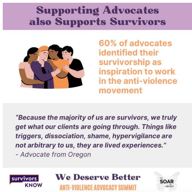
Figure 3: Supporting Advocates also Supports Survivors, Source: The SOAR Collective (May 2023)

As anti-violence advocates regularly encounter trauma and violence in their work, their own spiritual well-being and self-care are crucial. Over half of them experience severe traumatic stress symptoms and compassion fatigue, and approximately 16% meet the PTSD diagnostic criteria due to vicarious trauma exposure (Michigan Victim Advocacy Network, n.d.). Many advocates are also survivors themselves, further highlighting the importance of their self-care (The Soar Collective, n.d.).