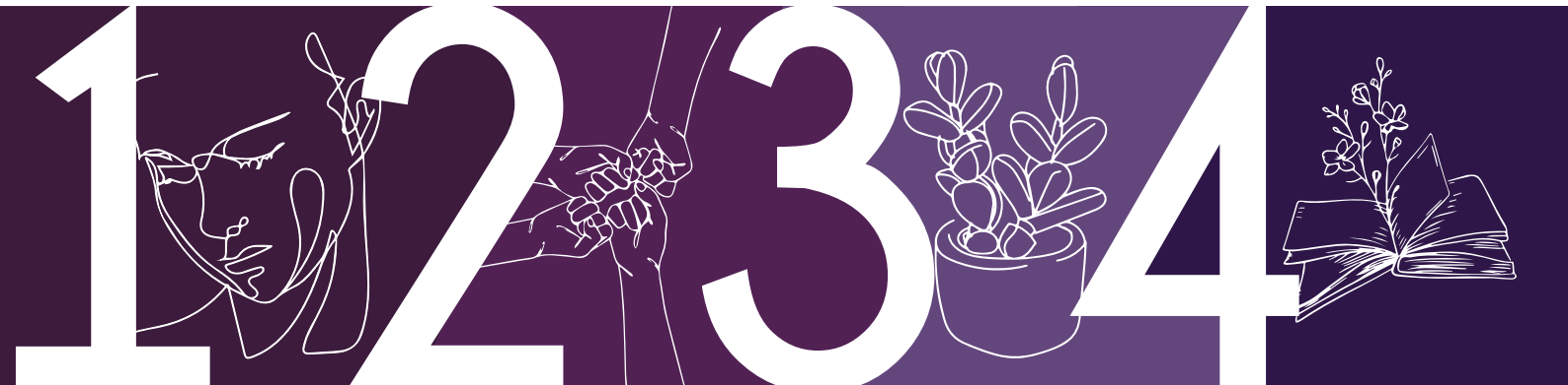
Figure 2: Four dimensions of spiritual health

When someone is spiritually healthy, they know who they are, they feel connected to others and the world around them, they have a sense of purpose, and they feel connected to something greater than themselves. Experiencing IPV can erode a person’s spiritual health, as perpetrators will often isolate victims from their faith communities or deny them access to their spiritual practices to maintain power and control. Sacred texts and religious doctrine may also be used to blame the survivor, to justify or minimize the violence, or to perpetuate silence and shame (FaithTrust Institute & FCADV, 2015). Helping survivors reconnect with their spirituality and promoting spiritual health can restore their connection with themselves, strengthen their social support system, and give them a sense of hope.