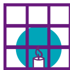
Light in the Window