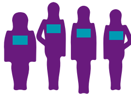
Silent Witness Displays